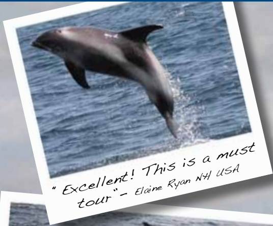
"Excellent! This is a must tour" - Elaine Ryan NH USA