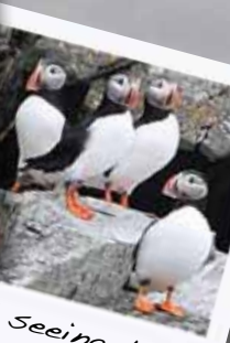
"Loved seeing the many seabirds"